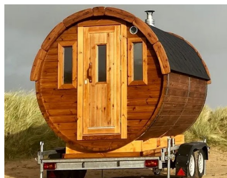
sauna on the beach

a large herd of cows joined us walking on the street and golf course - exercising their right to roam through the village!